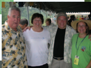
You're going to bid HOW MUCH on that beach bike?