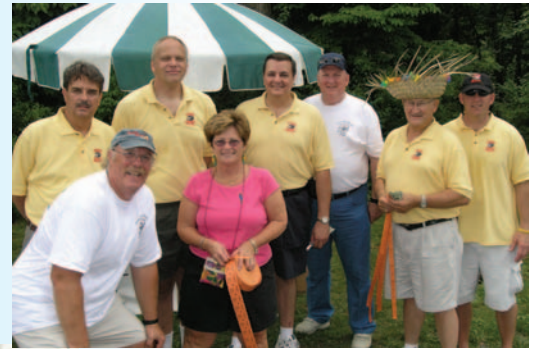
Crime Alert volunteers working the front gate.