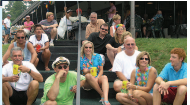
Bantering with the band.