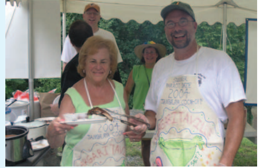
Serving up Applebee's ribs.