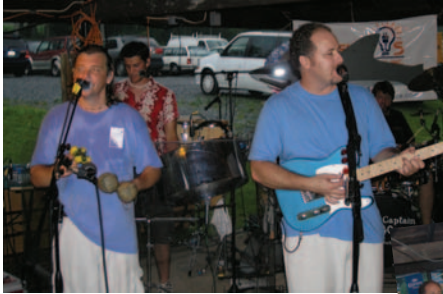
Captain Quint – told their email list that our Club really knows how to party!