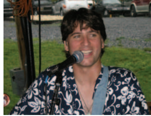
Parrot Head Bandstand