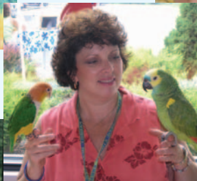
Birds of a pfeather pflocking together.