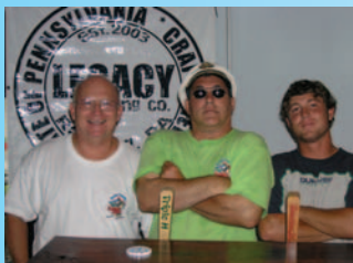
Legacy Brewing volunteers.