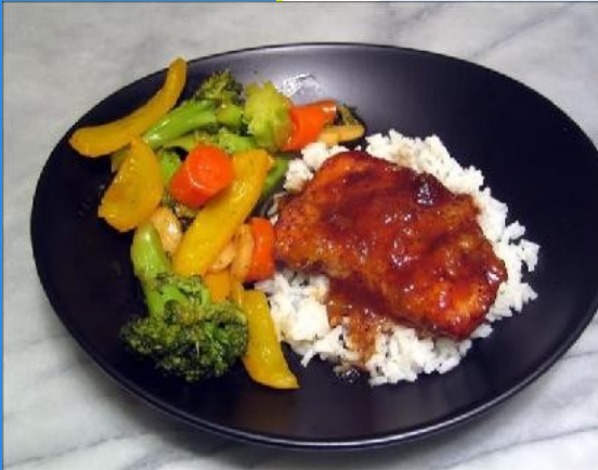
Caribbean Reef Chicken

“Arrange chicken on a serving platter. Serve over rice with a side of sautéed vegetables”.