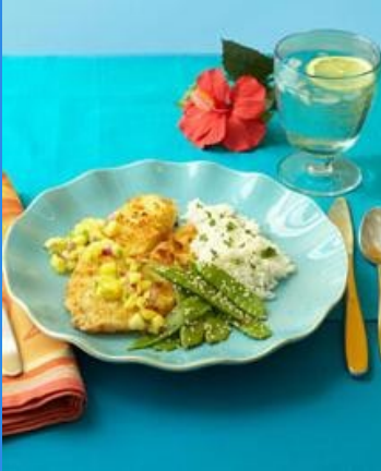
Macadamia Nut-Crusted Tilapia with Pineapple Salsa

“Bring out the bright colors in the middle of the winter to warm up even the dreariest slush day.”