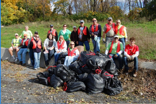
The BCPHC cleanup crew shows off their accomplishments

“... the weather cooperated, with the temperatures reaching the low 60s and the sun shining for the better part of the afternoon.”